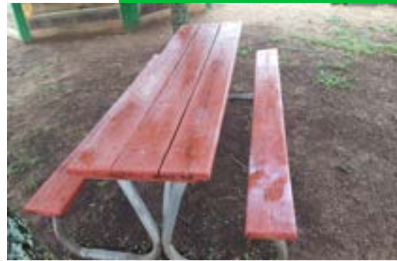
Refreshed and Ready to Go!