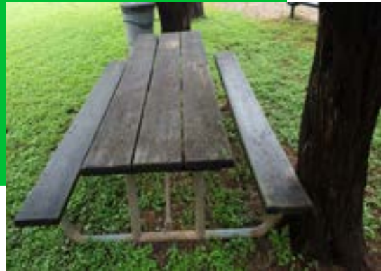
Original picnic table