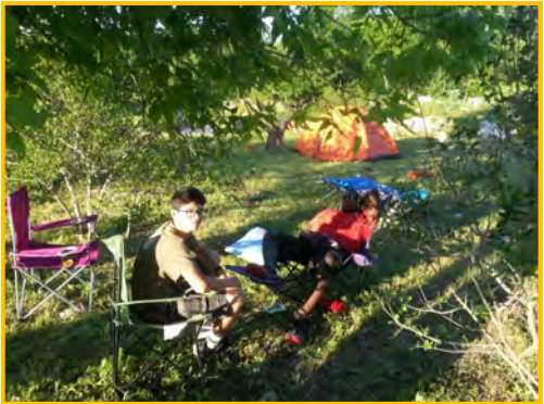
TROOP 256 enjoying their Tender-foot Weekend at Doe Run Park!

Come on Shady Hollow! Get on board and be good neighbors! PUT AWAY YOUR TRASH CANS