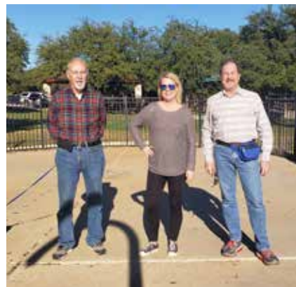
What are these guys up too?