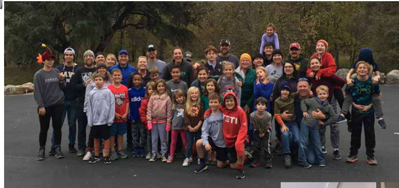
Turkey Legs vs Canned Yams Kickball Event