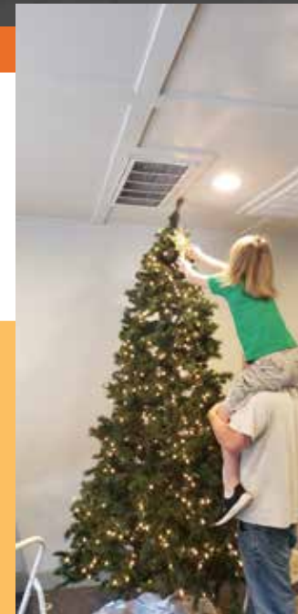
Kind Krew Decorating Committee