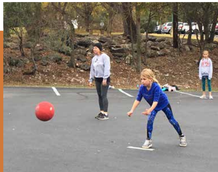
Thanksgiving Kickball Event