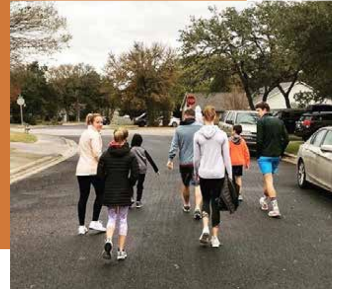
Turkey Trot participants on the run