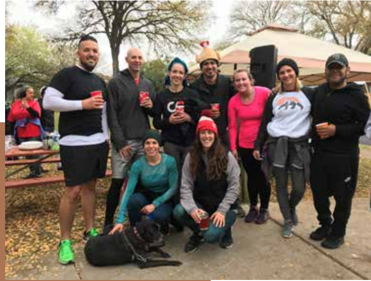
Camp Gladiator Celebrating at the Turkey Trot