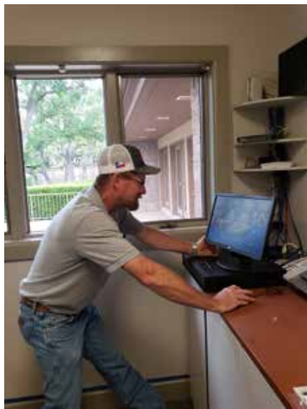
CC Security Cameras Installed