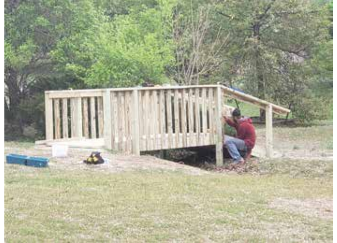
Doe Run Park Bridge Replacement