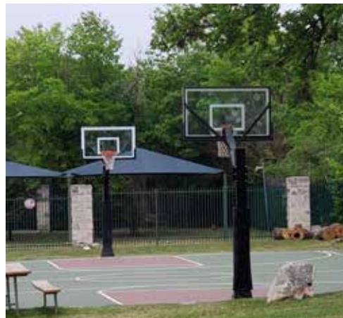
Capistrano Park New Basketball Hoops and Tree Planting