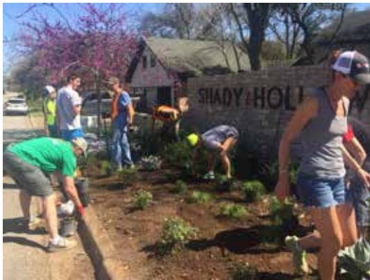
STAY LIT Volunteers Hard at Work